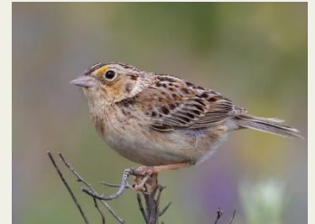
Figure 3. Grasshopper sparrow, a species of concern for BCR 17.

Trend - update priority species lists (e.g., State Wildlife Action Plans) by examining state or region-wide trend estimates. Have populations of these species increased or decreased each year and in which strata? Compare stratum-level trends with regional trends for context to see if regional patterns match local ones. Identify species of concern based on populations that are declining with certainty each year (i.e., trends with f > 0.9 ).