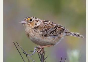
Figure 3. Grasshopper sparrow, a species of concern for BCR 17.

Trend - track and update priority species lists (e.g., Species of Greatest Conservation Need) by examining trend estimates. Are populations of these species increasing or decreasing with certainty each year and in which strata or regions? If looking at trend estimates for a particular stratum, look at regional trend estimates for context to see how local and regional trends compare. Identify species of concern based on populations that are declining with certainty each year, especially for species with concern elsewhere in their range.