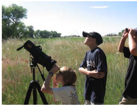
Kids have fun and learn skills like bird identification at RMBO workshops and outings.