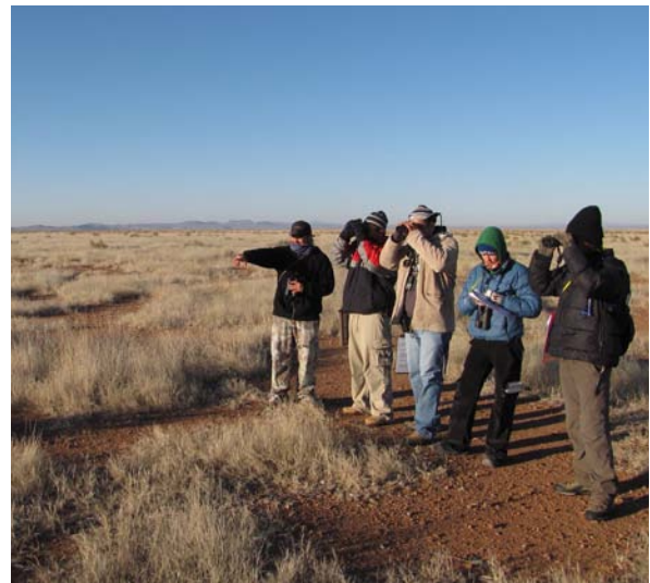
Field technicians at the Reserva Ecológica El Uno, a 45,000-acre grassland preserve and research facility owned by The Nature Conservancy in Janos, Chihuahua. TNC donates use of the facility for RMBO to house field crews and train technicians in grassland bird identification and scientific bird and habitat sampling protocols.