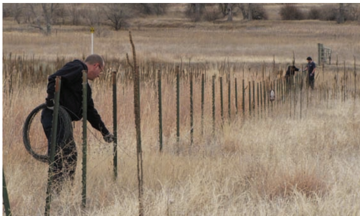
Forty-five employees from Vestas Nacelles America, Inc., volunteered to tackle several projects, moving RMBO's new Environmental Learning Center closer to its completion next year.

With friends like these, RMBO's Environmental Learning Center will be in full swing right on schedule.