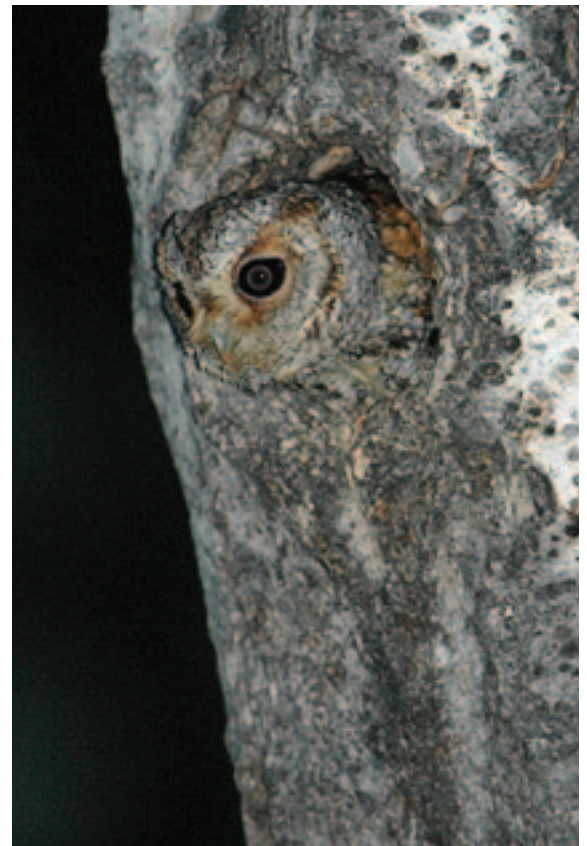
A Flammulated Owl peeks out of its nest cavity.

To better understand the distribution and habitat associations of Flammulated Owls, RMBO developed and tested a sampling design to survey for this species in collaboration with USFWS, USFS, Idaho Bird Observatory, HawkWatch International and PRBO Conservation Science. The sampling design worked well, and in 2011 RMBO will partner with the USFS and USFWS to survey 12 national forest units in Colorado, Wyoming, Nebraska and South Dakota.