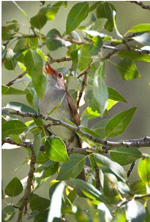
An Orange-billed Nightingale Thrush made a surprise visit to South Dakota last summer.

Once the survey results are compiled, RMBO will share them with area businesses, tourist agencies and land managers to illuminate birding's benefits to the local economy. We also may use the results to develop special birding programs in the Black Hills. The completed survey report will be posted at rmbo.org .