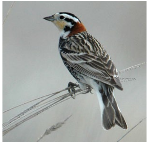
Grassland birds like this Chestnut-collared Longspur are declining throughout their ranges.

Grassland Priority Conservation Areas in Mexico and the southwestern U.S. are the focal points for conserving healthy desert grassland ecosystems, including migratory birds and other species that do not adhere to state or national boundaries.