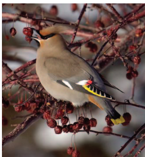
Bohemian Waxwing

Winter can make it tough for birds to find foods like insects and seeds. Cold temperatures or snow can make bird feeders busy places. To make this feeder