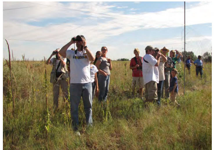
Visitors and staff scope out the prairie surrounding RMBO's Old Stone House at Barr Lake State Park.