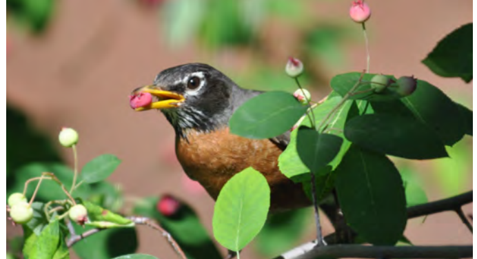
Nothing says spring like a robin dining in a tree!

Visit www.rmbo.org , call 303-659-4348 ext. 17, or e-mail kelly.thompson@rmbo.org THANK YOU for supporting Rocky Mountain Bird Observatory and bird and habitat conservation!