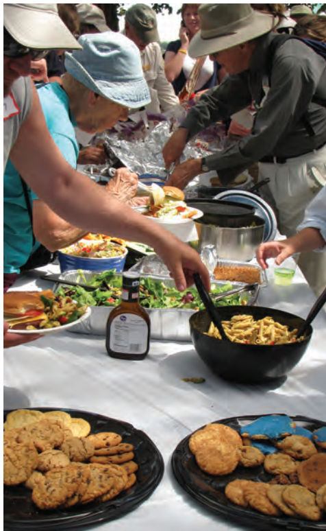
Food and fun were plentiful at the 2010 BBQ for the Birds. The 2011 event on August 27 also marks the grand opening of RMBO's Environmental Learning Center.