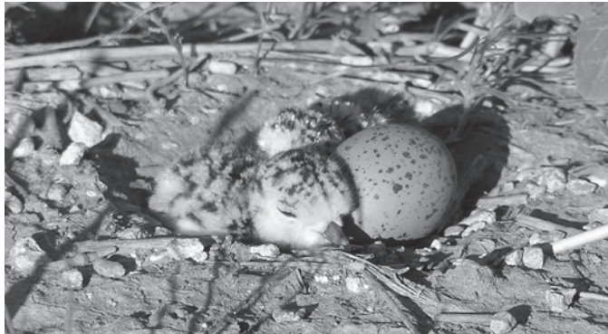
Mountain Plover chicks and egg.

The Mountain Plover breeds in the western Great Plains states on flat, bare ground in