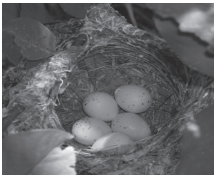
The best proof of breeding in a Breeding Bird Atlas is to find a nest, such as this Bell's Vireo nest.

Notes on a Spink County landowner's reaction to results of our atlas survey on his land: "Interested in project and very proud of his native grasslands and the good condition they are in. Fascinated to have a heron rookery on his land, but did not know it was there until I told him about it."