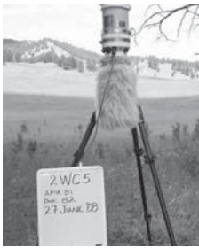
An recording unit used in the Black Hills. The fur shields the microphone from wind noise.

Many current bird-monitoring protocols include distance sampling. This kind of