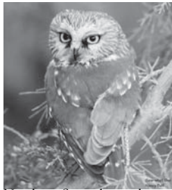
Northern Saw-whet owl.

As a result of this cooperative study we anticipate helping with a state-wide protocol for nightjars. We also anticipate wildlife biologists in the panhandle incorporating our results into their management prescriptions on private and public lands. The Nebraska