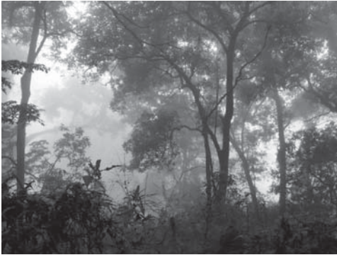
Cloud Forest, Jalisco