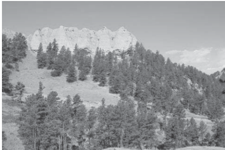
Chadron State Park, NE.