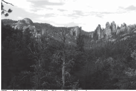
The Black Hills, SD.

The Black Hills of South Dakota and Wyoming are referred to as “An island of trees in a sea of grass”, and rightfully so. The pillars of tree covered Precambrian granite disgorge into the sky from the North American Plains, making it a harbor for plant and animal life in the area that is truly worth observing. These pillars are most notably recognized for the well known Mount Rushmore, Devils Tower, and Crazy Horse Memorial. The hills were formed from volcanic uplift millions of years ago, with the core of the dome shaped island reaching 7,424 ft. above sea level.