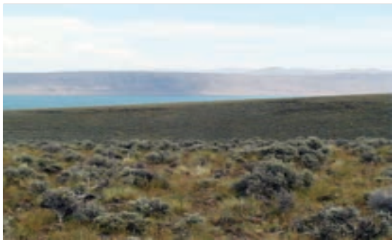
Healthy sagebrush steppe habitat.