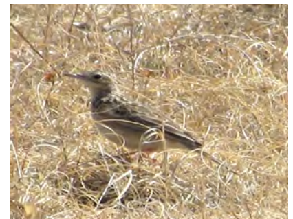
Sprague's Pipit is a species of concern in the Chihuahuan Desert grasslands.

Contact Cary Atwood, 970-201-9651, catwood814@gmail.com .