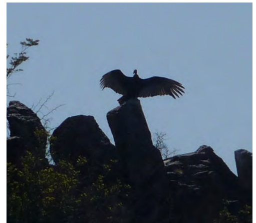
Sunset at Chisos Basin in Big Bend National Park in Texas (top). Black-throated Sparrows perch on ocotillo cactus, Carlsbad Caverns, New Mexico (left). A Turkey Vulture at Big Bend (right).