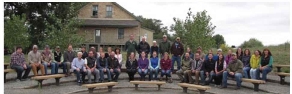
The staff and board gather for a photo in September of 2014 at RMBO's Environmental Learning Center at the Old Stone House at Barr Lake near Brighton, Colorado.