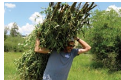
A volunteer transports cottonwoods to be planted along the Navajo River during an event to kick off the restoration project.

In 2014, RMBO, USDA Natural Resources Conservation Service, San Juan Conservation District and other partners kicked off a multi-part project to restore a nearly 7-mile-long stretch of the Navajo River in southern Colorado impacted by a diversion structure. On July 25, 35 volunteers attended a kick-off event to plant more than 200 native trees on two private properties along the river, home to the Lewis's Woodpecker and Red-naped Sapsucker. Over the next two years, RMBO and partners plan to install in-stream structures, create meanders through the existing channel, build three wetlands and plant more trees as part of the project, which will increase water quality and habitat for birds and other wildlife.