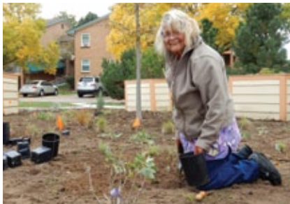
A resident of an assisted living facility plants native perennials in her facility’s new bird-friendly garden, installed through Bird Tales.

For the last two years, RMBO has offered a therapeutic program called Bird Tales to residents of three assisted living facilities in the Denver area. Bird Tales is aimed at improving the quality of life for people living with dementia through birds, combining the stimulation of Audubon plush birds with the engagement of wild birds right outside residents’ windows. RMBO facilitated 45 separate Bird Tales offerings in 2013 and 2014, bringing the healing power of nature to more than 500 people. “We have found through this wonderful program how incredibly comforting, reassuring and secure the sound of birds can be to those in distress,” one care services director said. “This program is nothing short of amazing.”