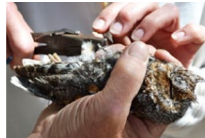
This owl was one of two Flammulated Owls caught at Chico Basin Ranch last spring. The species was a first for the Chico banding station, having only been spotted twice before on the ranch, once in 2004 and again in 2005.