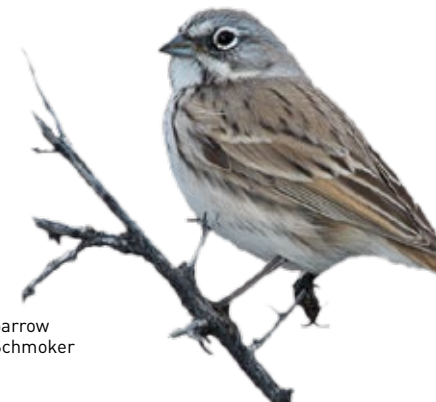
Sage Sparrow by Bill Schmoker