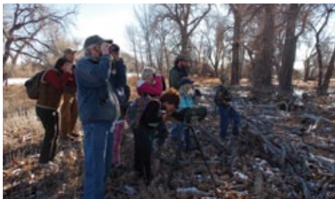
Anyone with budding young birders is encouraged to bring them out to RMBO's next Christmas Bird Count for Kids at Barr Lake State Park in Colorado.

Also in 2014, RMBO coordinated Bald Eagle Watch, HawkWatch, ColonyWatch and other citizen science efforts to get people engaged in bird conservation and advance our knowledge of local bird populations, nesting needs and migration routes.