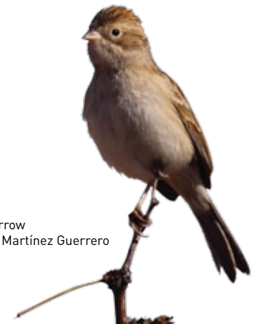
Brewer’s Sparrow