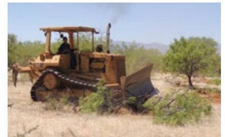
Invasive mesquite is removed from a ranch in Mexico to create ideal habitat for grassland songbirds and improve forage for livestock.

Through long-term research on the wintering grounds, RMBO has learned that several high-priority declining songbirds will not occupy grasslands with shrub cover. To increase suitable habitat, RMBO worked with partners to remove mesquite, an invasive native shrub, from 1,435 total acres across three private properties in northern Mexico last year. These shrub removal projects, paired with reseeding of native grasses when necessary, will increase numbers of priority species such as Baird's Sparrow, Sprague's Pipit and Chestnut-collared Longspur. Additionally, the projects will improve forage quantity and quality for livestock – a win-win for birds and people.