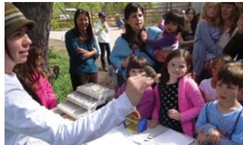
RMBO shared the beauty and science of birds with the many families who attended Poudre RiverFest in Fort Collins, Colorado.

In May of 2014, RMBO co-hosted Poudre RiverFest in Fort Collins, Colorado, to celebrate, restore and educate people about the Cache la Poudre River. More than 1,000 people attended the festival, organized by RMBO and fellow nonprofits Save the Poudre, Sustainable Living Association, Fort Collins Museum of Discovery and Wildlands Restoration Volunteers (WRV). With the Poudre River impacted by the 2013 floods, Poudre RiverFest was a chance for citizens to pitch in for the Poudre River and celebrate the natural lifeline of the community. WRV coordinated restoration activities. RMBO ran a bird banding station and led nature walks in the morning. The museum led kids' activities, and the day culminated with a celebration of the river that included live music and booths from more than 40 partners. Poudre RiverFest returns to Fort Collins on May 30, 2015. More info at www.poudreriverfest.org .