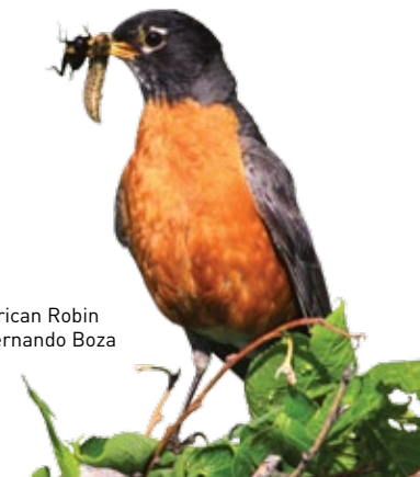
American Robin