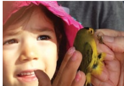
A child gets a close look at a Wilson’s Warbler at RMBO’s bird banding station at Barr Lake State Park in Colorado. More than 40% of all birds caught at Barr Lake during the fall season were Wilson’s Warblers.

In 2014, RMBO and partners operated three banding stations in the spring in Colorado and seven in the fall in Colorado and Nebraska. In addition, RMBO operated banding stations for Northern Saw-whet Owls in North Dakota and South Dakota last fall. The stations served as outdoor classrooms for studying bird migration and anatomy and enhancing the public’s appreciation of birds. The highlights to the right show what RMBO is learning about migration routes and the life history of birds.