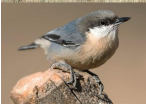
An IMBCR surveyor and a pygmy nuthatch.

The IMBCR program is able to provide population estimates for 300+ species to inform management and conservation efforts using a relatively small investment from each partner.