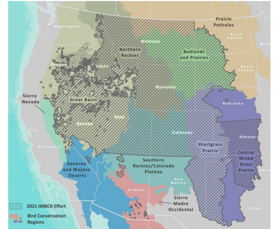
Extent of the IMBCR program as of 2021.

The Integrated Monitoring in Bird Conservation Regions (IMBCR) program was created in 2008 in response to avian population declines and national recommendations for improving avian monitoring. Today, the IMBCR program is the second largest breeding bird monitoring program in North America, spanning the Great Plains to the Great Basin. The strength of the IMBCR program lies in its partnership with multiple state and federal agencies, joint ventures, and NGOs with Bird Conservancy of the Rockies leading the effort. We pool monitoring resources among the partners in a spatially balanced, probabilistic framework, which promotes efficiencies in field work and analyses and allows us to provide population estimates for over 300 species including songbirds, gamebirds, common raptors, and some waterfowl and shorebirds.