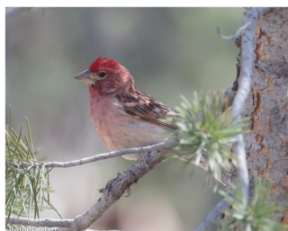
Cassin's finch, a Bird of Conservation Concern for BCR 10 and 16.