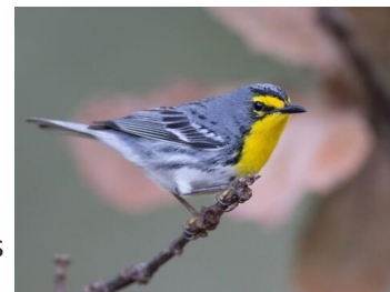
Grace's warbler, a focal species for the Coconino National Forest.