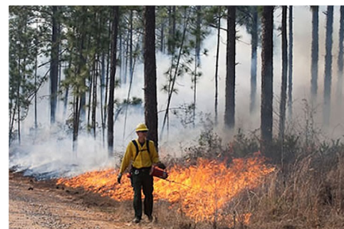
A prescribed burn conducted by the USFS.

We evaluated effectiveness of forest restoration treatments implemented across the Front Range in Colorado through a targeted monitoring project, and found that species richness increased with percent area treated, as well as occupancy for several species like olive-sided flycatcher, a sensitive species for Region 2. Effectiveness monitoring data also inform maps of opportunities to promote avian diversity, along with other ecosystem services, on public and private lands.