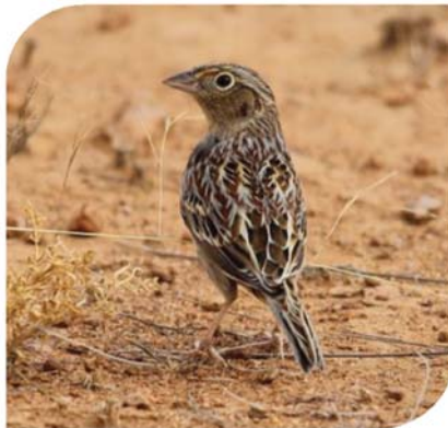
Grasshopper Sparrow