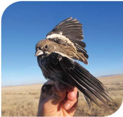
Lark Bunting