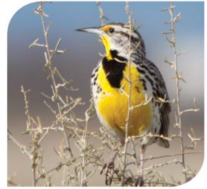
Western Meadowlark