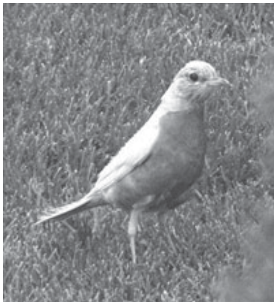
Fig. 1. Crystal.

In June, 2005, to our surprise, a lovely white female (named her Crystal; Fig 1) began to build a nest five feet up in a floppy, unstable bush next to our driveway. She was not a white robin. Her head, back, tail, wings, legs and feet were white. Her breast was orange (it seemed brighter orange than other robins) and she had black eyes and a yellow beak. She looked exactly like the robin I saw five years ago.