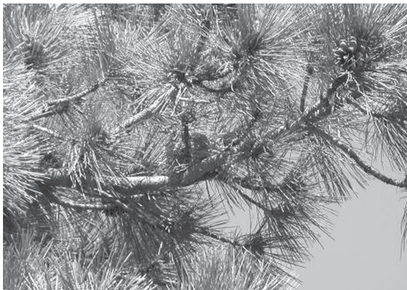
Fig. 1. Female Hepatic Tanager attending to the nest.

Found the nest. Since according to 18 June note (female sitting on the nest midday), I assumed she was incubating when I found the nest. I never saw fledglings, so it would be impossible to count backwards from the parents leaving the nest (June 29) to the date that I discovered the nest to indicate what stage they were in.