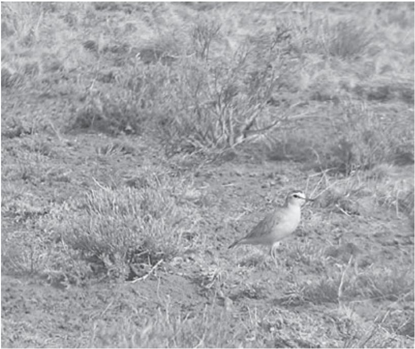
Mountain Plover in Costilla County, May 2005.

with wind-speed at the time of observations ranging from no detectable wind up to speeds between 19 and 24 mph. Morning wind-speeds were generally slower than those in the evening. The distance from the biologists to the observed birds ranged from 3 to 394 ft.