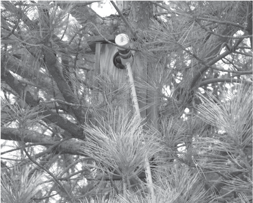
Fig. 1. With a camera mounted on the end of PVC pipe, a "peeper" is used to investigate a nest box for occupancy.

On the 2004 count we initiated our latest technique to address the behavioral inconsistencies - a "peeper" (Fig. 1). This device (which was funded by a CFO Project Fund grant) consists of a miniature TV camera mounted into a short piece of 1 ½-inch PVC pipe, which is attached to the end of a 25-foot telescoping pole. When the camera is hoisted to the box opening and inserted, it broadcasts a clear picture of the box contents to a receiver below. On the 2005 count, the peeper accounted for 10 of our 47 screech-owls.