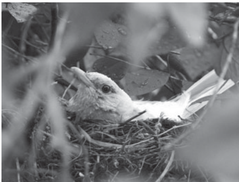
Fig. 2. Crystal attending her nest.

Two chicks had hatched and one egg remained in the nest.