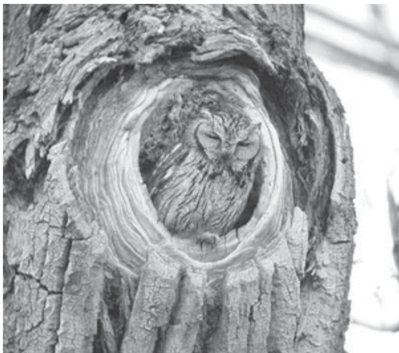
This Western Screech-Owl blends in well with its background while filling the entrance of a cavity.