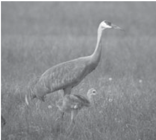
Fig. 1. Adult Sandhill Crane with fledgling at Lower Latham Reservoir, Weld County, on 28 May 2005.

Semo, L. S. and N. Pieplow. 2006. News from the Field: the Summer 2005 report (June-July). Colorado Birds 40:45-61.