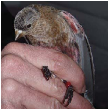
Brown-capped Rosy Finch with colorband on left leg.