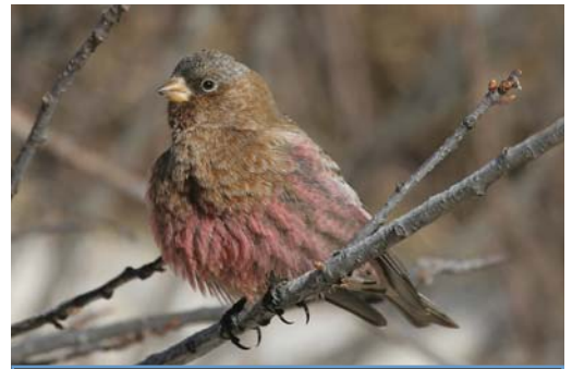
On the cover: Brown-Capped Rosy Finch