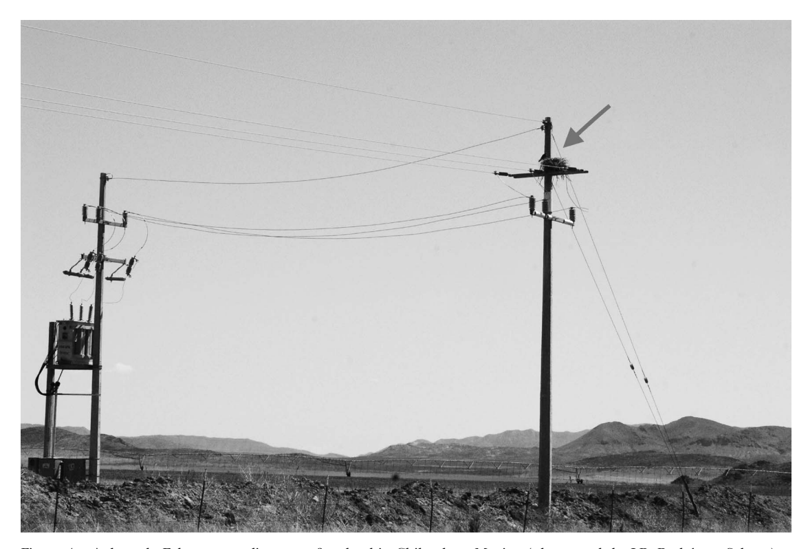
Figure 4. Aplomado Falcon nest adjacent to farmland in Chihuahua, Mexico (photograph by J.R. Rodríguez-Salazar).

and other management practices are worthy of immediate consideration in view of the predicted negative consequence of inaction.