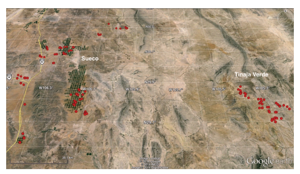
Figure 3. Spatial distribution of Aplomado Falcon nesting attempts (red dots) during 1997 to 2014 in the Sueco and Tinaja Verde study areas (see Macías-Duarte et al. 2004). The natural grasslands composing 17 breeding territories were converted to 800-m-diameter central-pivot irrigation agricultural plots (green circles) beginning in 2006. Numbers following the letters N and W denote latitude and longitude in decimal degrees, respectively.