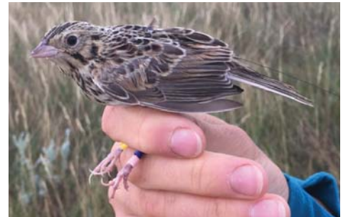
Adult Baird's Sparrow after being fitted with transmitter.

coyotes, ground squirrels, weasels, and snakes. Some nests were abandoned for unknown reasons. The failures, though disheartening, nonetheless give insights into the challenges facing these birds.