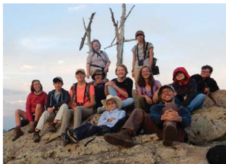
On the Wing Campers after a long hike in the mountains.

At that moment, in the rearview mirror I see hope and joy. I see self-confidence, freedom, healing, and peace. In the rearview mirror, I also see the future.