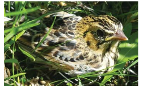
Fledged Baird's Sparrow wearing transmitter.

coyotes, ground squirrels, weasels, and snakes. Some nests were abandoned for unknown reasons. The failures, though disheartening, nonetheless give insights into the challenges facing these birds.