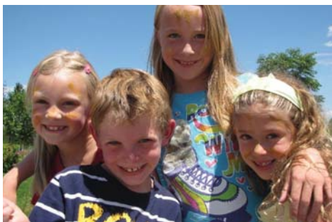
Winged Wonders day campers with fresh rock paint on their faces.

The growth that Camp participants experience is often profound, and starts on day one. In the rearview mirror, I often see first-timers to "Bird Camp" with looks of apprehension, nervousness and even a bit of fear. Maybe it's because they were forced to attend Camp by their parents, or that they were talked into it without really understanding what they were getting into. In the rear view mirror, I often see new campers struggling with low self-esteem, anxieties and insecurities, depression, poor physical health, and an indifference toward the natural world.