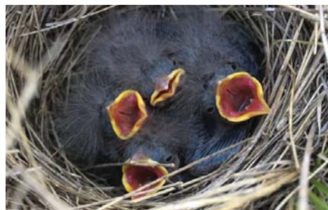
Four-day old Baird's Sparrows.

We monitored nests for survival (fail or fledge), and also attached transmitters to nestlings to track their survival. Unfortunately, many of the nests failed, often due to depredation. Predators include Northern Harriers,