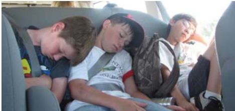
Young Ecologists day campers after a long day of field trips and birding.

As I look back on the summer of 2016, I cannot help but reflect on the impacts that our Nature Camps are having. Maybe it's because I'm often the van driver for Camps that I've come to think about the transformational process metaphorically, as though looking into a rearview mirror.