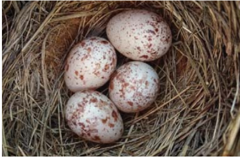
Baird's Sparrow eggs in a nest.

B ird Conservancy of the Rockies just completed a second summer season studying breeding season survival in adults and juveniles of nesting Baird's and Grasshopper Sparrows in the Northern Great Plains of North Dakota and Montana.